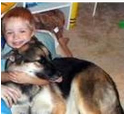
Don't hold or hug a dog tightly

Stroke the chest, under the chin, or ribs - rather than the head and face