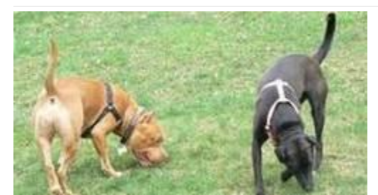
Sniffing - dogs sniff the ground but you can just sniff the air