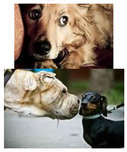
Calming signals are how dogs communicate with each other to:

Resolve conflict, calm themselves when fearful or stressed and to calm each other.